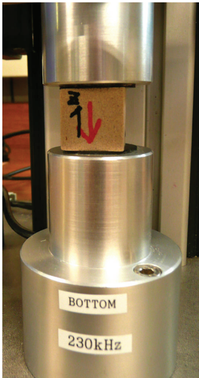
Ultrasonic transducers from the MSCL-DPW

For measurements on hard rock samples, it is important to apply a small but constant pressure on the sample during the measurement. This can be difficult to achieve manually, but is automatically accomplished with the MSCL-DPW. When the correct set pressure is reached on a rock sample the handle disengages from the ball screw preventing further pressure being applied. This enables the user to easily apply the same pressure on every sample for repeatable and consistent measurements.