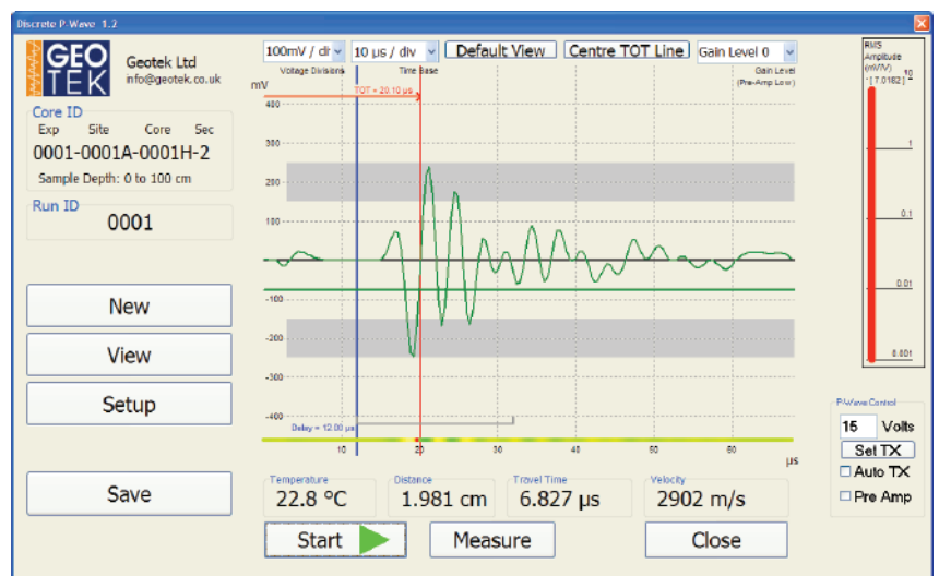
Custom designed software to automatically pick the first arrival and record the signal

The user need only ensure that the received signal is inside the time gate, and the software will choose the optimal power and amplification for the signal. If the user wishes, these variables can also be controlled manually.