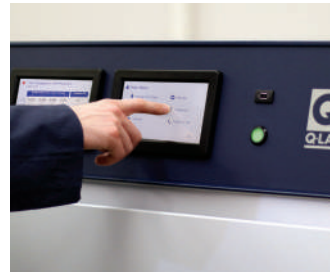
Onboard Displays (Gen 4)

Onboard touchscreen displays (Gen 4) or the UC1 Handheld Display (previous models) further simplify the calibration process through convenient drop-down menus to select tester, lamp, and optical filter configurations. Users can select one of eight languages (English, German, French, Spanish, Italian, Chinese, Korean, and Japanese) for calibration.