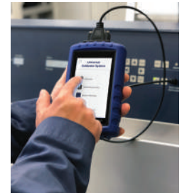
UC1 Handheld Display